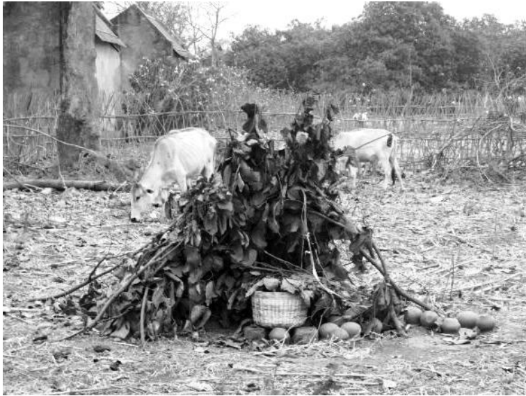
FIGURE 3: kumbhā for the hapram bonga (spirits of the dead).

not to turn him into a malevolent and revengeful bhulah spirit who will then put all his efforts into causing trouble for his disrespectful and ill-mannered descendants.