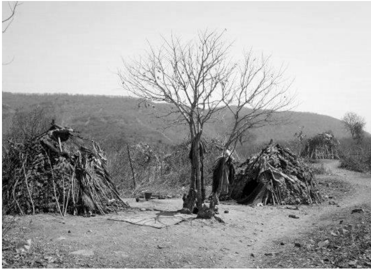
FIGURE 1: Danua tanda consisting of kumbhā .